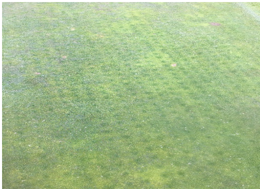
You can see healthy turf in all the old aerification holes.

We try to schedule aerification when we know we will have some of the best growing conditions. The goal is to try and have surfaces healed as quickly as possible. If done at the proper time it is not uncommon to be 90% healed within 5-6 days. If done too late in the year that 5-6 days can quickly turn into 10-12+.