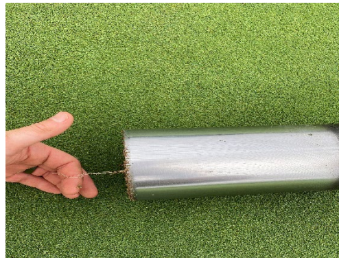
Additional support shown in the first week of August found multiple plugs while cutting cups with 9"+ roots from this springs deep tine aerification.

Here is a list of a few other things that we did this month.