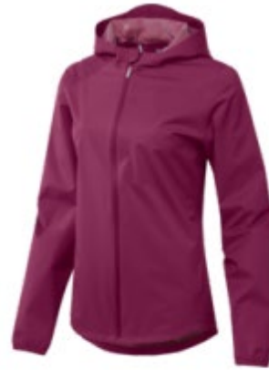
FT5952 WPROVSNL JKT power berry