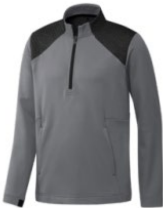
GC7111 COLD RDY 1/4 ZP grey three