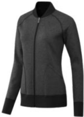
FK0638 RVSBL FULL ZP J black