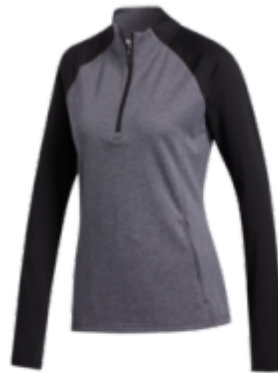
FT1540 HTR HLF ZP LYR black heather