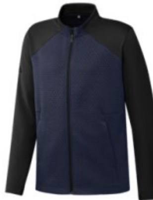
GD0812 COLD RDY JCKT collegiate navy mel. grey three