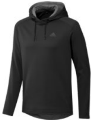
FQ8473 COLD RDY HOOD black