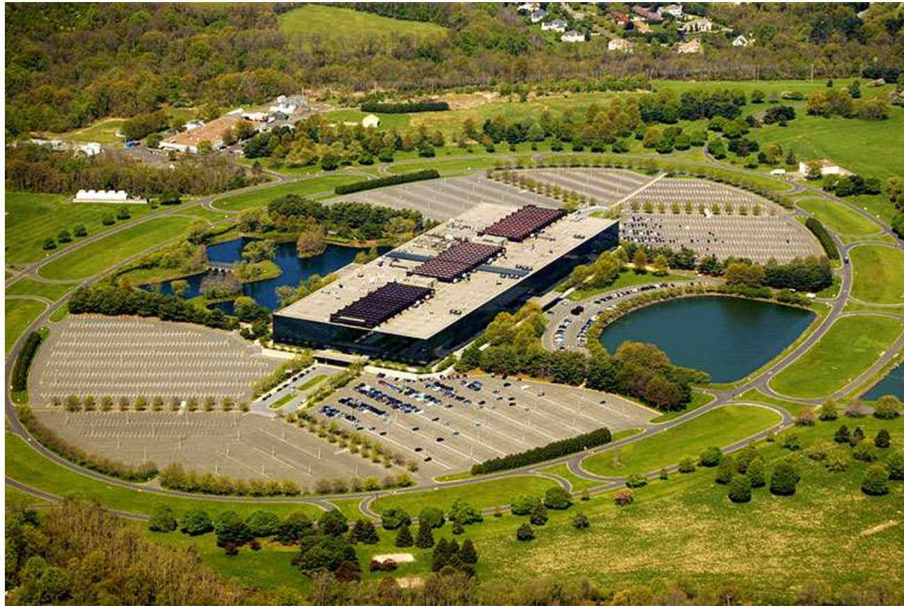
AERIAL OF FORMER BELL LABS CAMPUS IN HOLMDEL, N.J